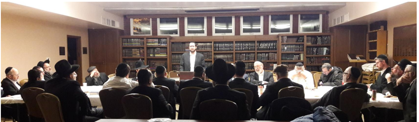
Part of the crowd at the first Men's Melava Malka 5778